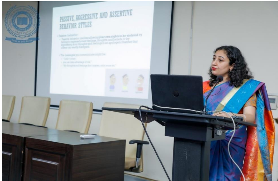
Session by the Guest Speaker