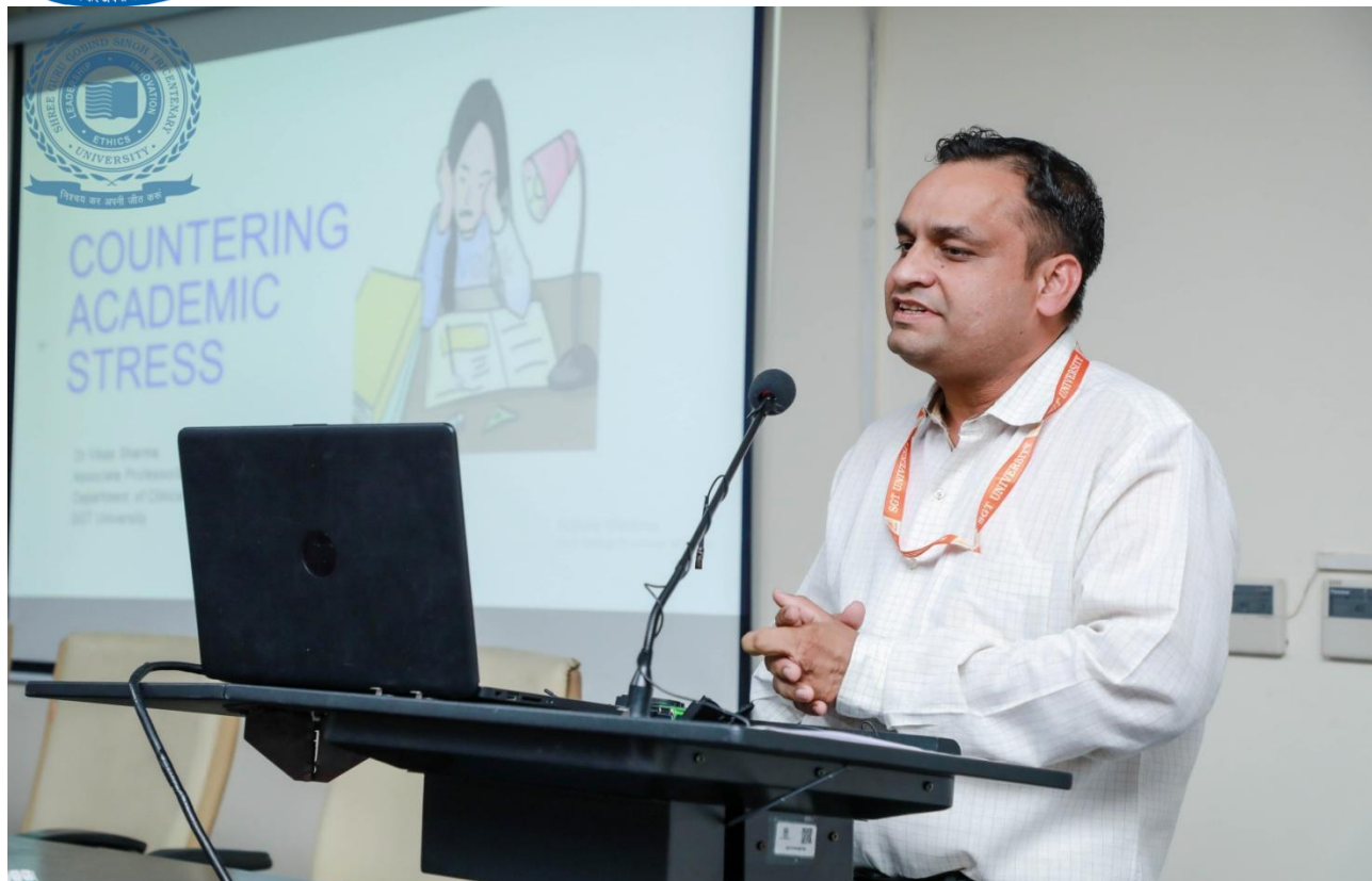
Session on Countering Academic Stress

SHREE GURU GOBIND SINGH TRICENTENARY UNIVERSITY (UGC & AICTE Approved) Gurugram, Delhi-NCR