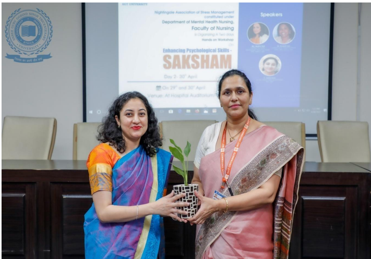
Welcome of the Guest Speaker.