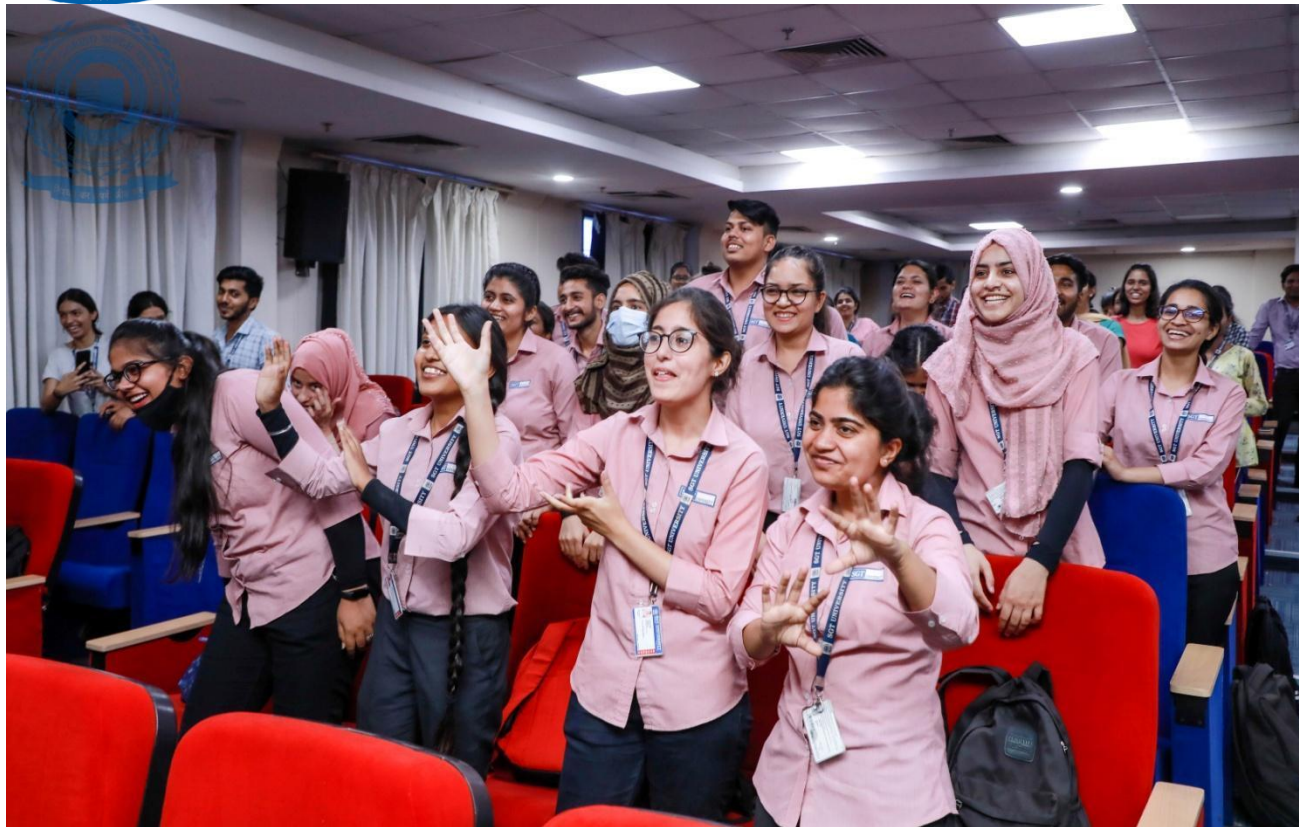
Engaging participants in Hands on Training