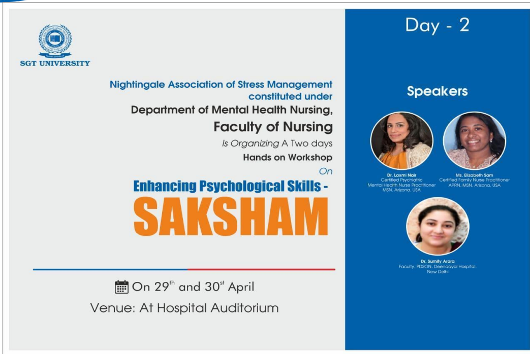
Banner of The Event