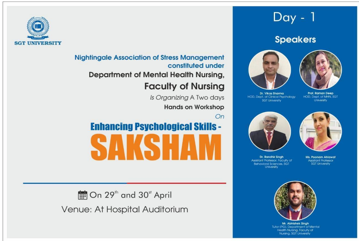
Banner of the Event