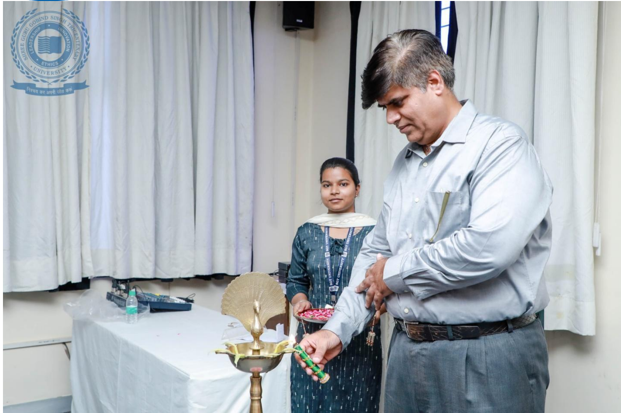
Inauguration by the chief Guest